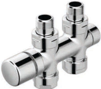
Set type O Valve (turnable left or right)

50 mm straight, thermostatic insert M30x1,5 mm with pre-setting 1-7 and by-pass, turnable for manual handwheel to the left or right, including 2 pcs 3/4" Eurocone nuts Ø 16,8 mm in finish of valve body, without adaptors for pipes